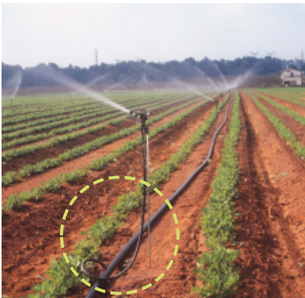
The stand positioned close to the start connector

Insert the rod with the stabilizer ring up to the upper point of the ring.