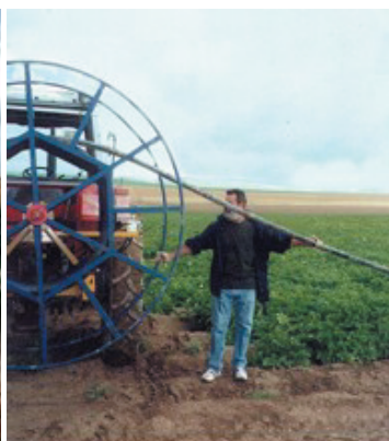
Removing tubes from field and winding on reels