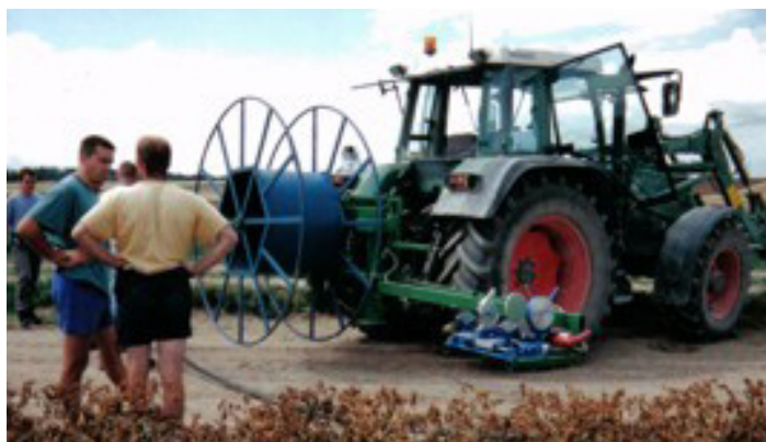
Combined winder and welding machine