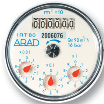
IRT type dial