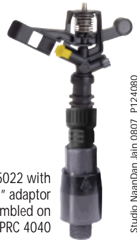
5022 with 1/2" x 1/2" adaptor assembled on PRC 4040